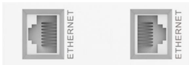
TC3 Dual RJ45 Module (bare-wire on rear) More info –