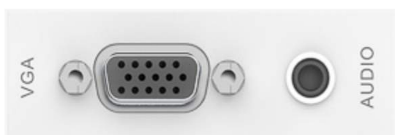
TC3 VGA and Audio Module (phoenix on rear) More info –