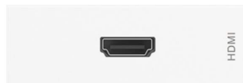
TC3 HDMI Module More info –