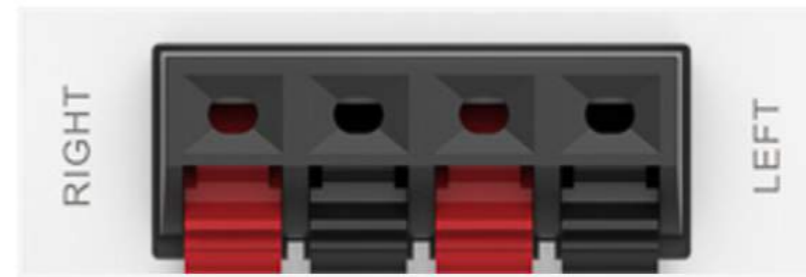
TC3 4-port Barewire Speaker Module More info –