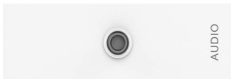
TC3 Minijack Module (phoenix on rear) More info –