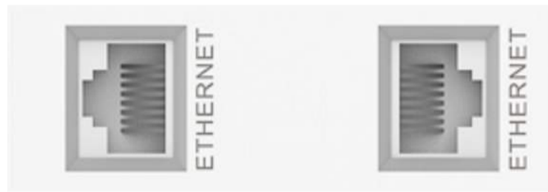
TC3 Dual RJ45 Module (bare-wire on rear) More info –